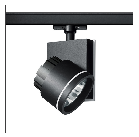
IP 20 ⊕ c €