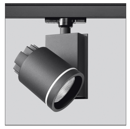
IP 20 ⊕ c €