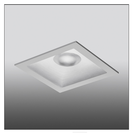
IP40 Dimmerable: + 10-