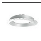
Sharp edge trim M240500