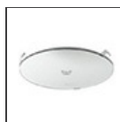
Opal screen in PMMA M239700