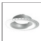
Support with rounded edge trim M240600