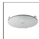
Prismoptic screen in polycarbonate M239600