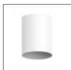
Accessory for ceiling installation M239820