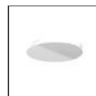
Transparent polycarbonate screen M239200