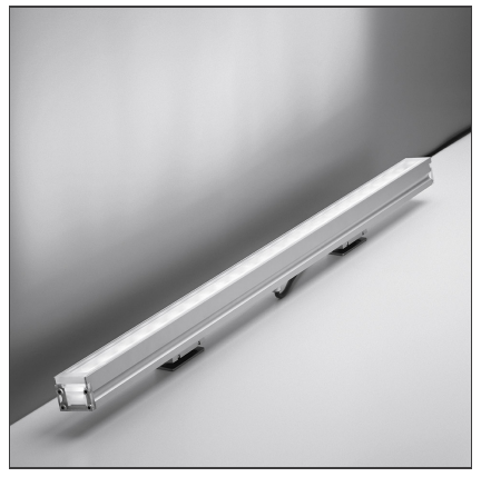
IP65/67 ♠ ▼