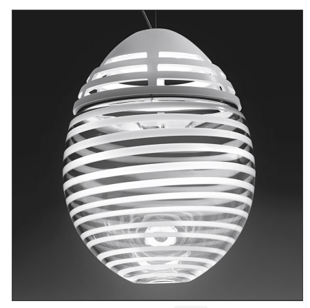
IP20 🖺 Dimmerable: + 🛈 -