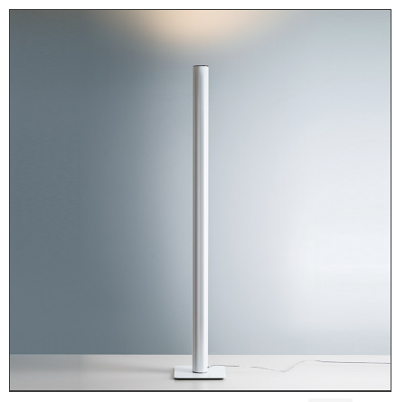
IP20 ⊕ 🥨 🤃 C€ Dimmerable: +①-