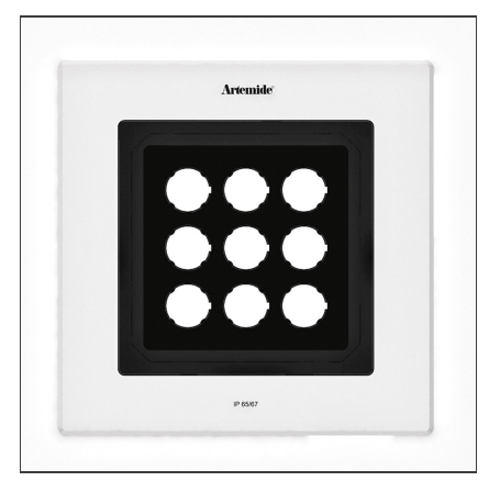
IP 65/67 🕼