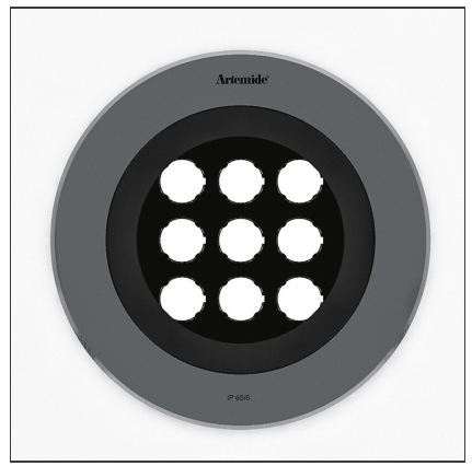
IP 65/67 🕼