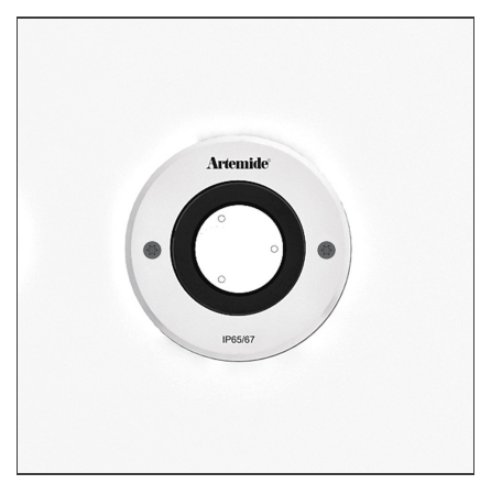
IP 65/67 🗥