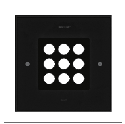
IP 65/67 ⊕