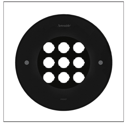
IP 65/67 (1)