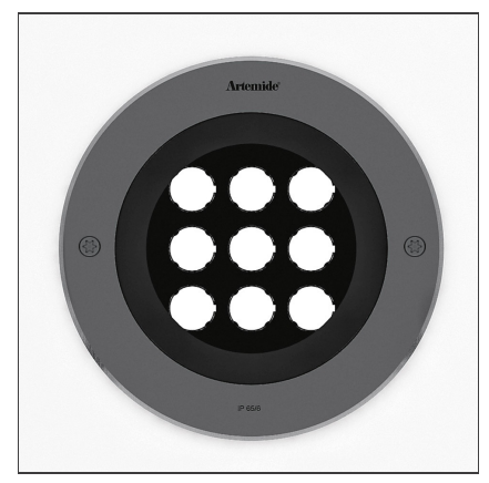
IP 65/67 🗥