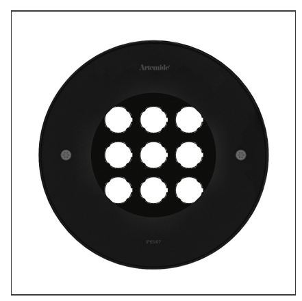
IP 65/67 🕼