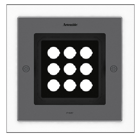
IP 65/67 (1)