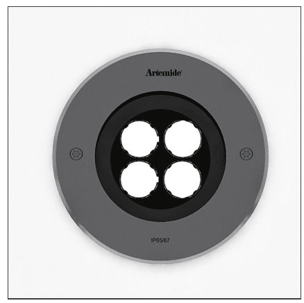
IP 65/67 ⊕