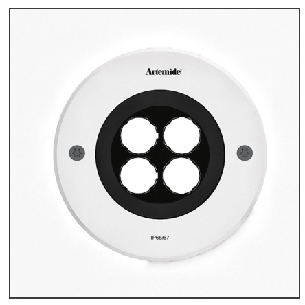
IP 65/67 ⊕