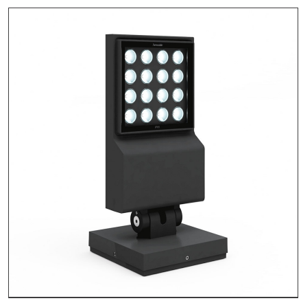
IP65 (≟) ( ₹15 )▼