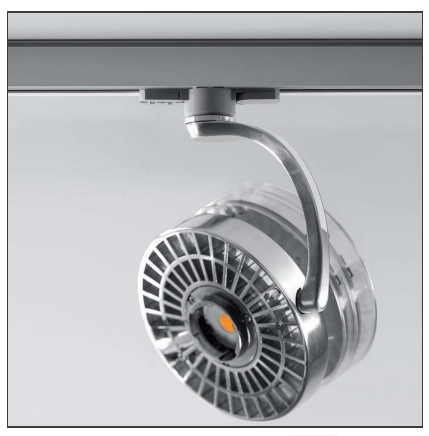
IP20 ( Dimmerable: +0-