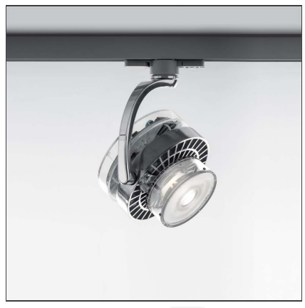
IP 20 Dimmerable: + 10-