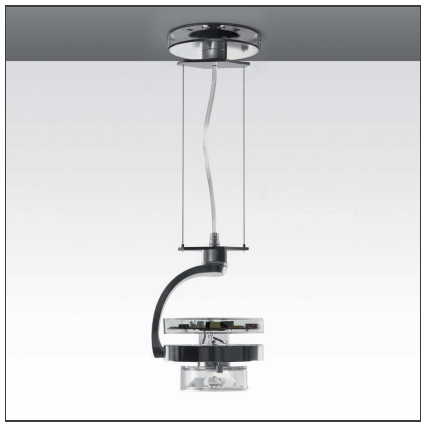
Dimmerable: + 10-