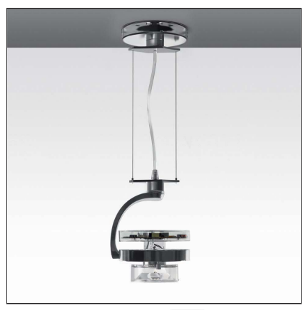
IP20 🚇 Dimmerable: + 🕦 -