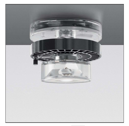
Dimmerable: + 10-