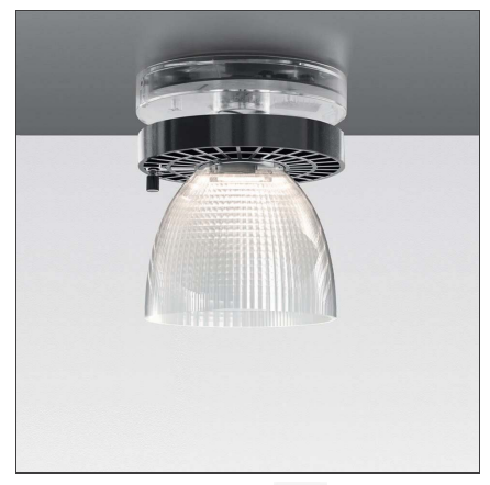
IP20 🖨 Dimmerable: + 🕦 -