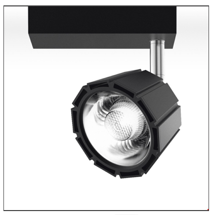
IP 20 ☐ Dimmerable: + ① -