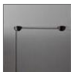
AGGREGATO SOSP ROSONE DECENT A086000