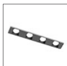
Louvre - 2368mm 4x4 optics white AE42001