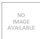
Sharping wall grazer lens Kit (4pcs) - 26°x70° elliptical lenses kit. It has to be used on top of S 20° reflectors to get an elliptical beam (greter axis along the module lenght). It contains 4 lenses. AF06000