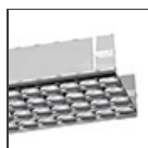
Algoritmo System LED - Optics - Controlled Emission - 1184mm M186700