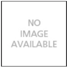
A.39 - Opal Diffuser in Polycarbonate - L=2368mm AT10200