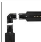
100% - 90° Connector White DRL1903AKTC110B