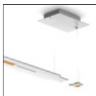
100% - Power supply kit 120W 2/4 modules White DRL1903AKB05