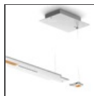
100% - Power supply kit 320W 5/7 modules White DRL1903AKC05