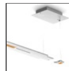
100% - Power supply kit 40W 1 module White DRL1903AKA05