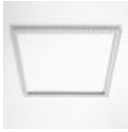
Recess frame for installation on plasterboard false ceiling. 625x625mm. M160602