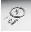
SOLAR II - Suspension kit. M080403