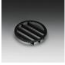
TOPLITE - Louvre M081047