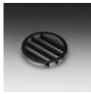
TOPLITE - Louvre M081047

Electronic transformer 230-240V/12V. Class II. Dimmable by trailing or leading edge external dimmers. 10-60W. 123x32x23mm. M070211