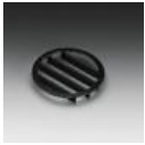
TOPLITE - Louvre M081047