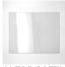
ALTOP SOFTLIGHT SCREEN IN TRANSPARENT POLYCARBONATE M163400