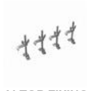
ALTOP FIXING BRACKETS (SET OF 4 PCS) M163520