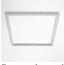
Recess frame for installation on plasterboard false ceiling. 600x600mm. M160600