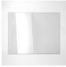
ALTOP SOFTLIGHT SCREEN IN TRANSPARENT POLYCARBONATE M163400