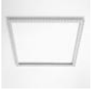
Recess frame for installation on plasterboard false ceiling. 625x625mm. M160602