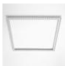
Recess frame for installation on plasterboard false ceiling. 625x625mm. M160602